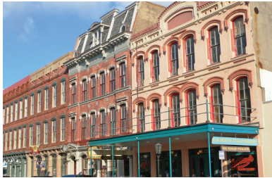
Downtown Galveston includes a wide variety of historic architectural styles.