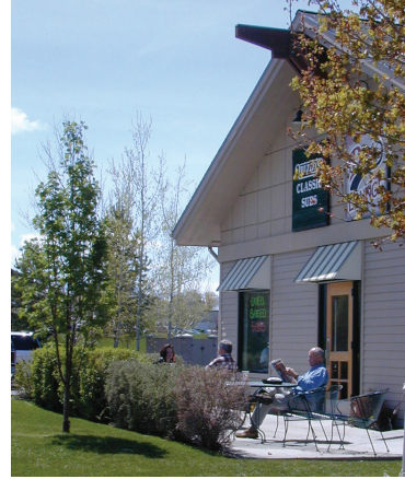
The guidelines also address location and desired character for outdoor plazas.