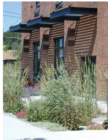
Examples of compatible building materials and details are included in the guidelines to help illustrate their application.