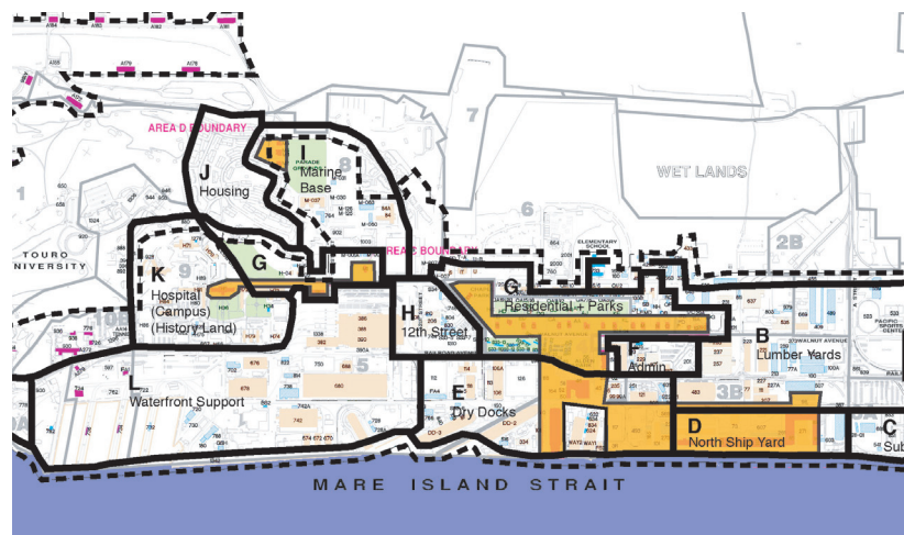
A framework map identifies key features and character areas on the island.