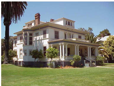
Mare Island includes a diverse range of character areas and building types reflecting over 150 years of military history.