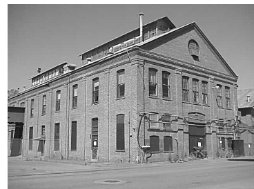
The design guidelines promote re-use of the island's historic industrial buildings.