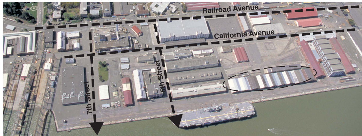
The design guidelines identify key connections and view corridors to the water.