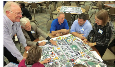
Winter & Company organized a design charette to help the community articulate a vision for the Village.