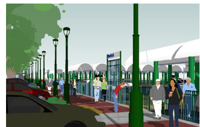
Pedestrian promenade along the marina