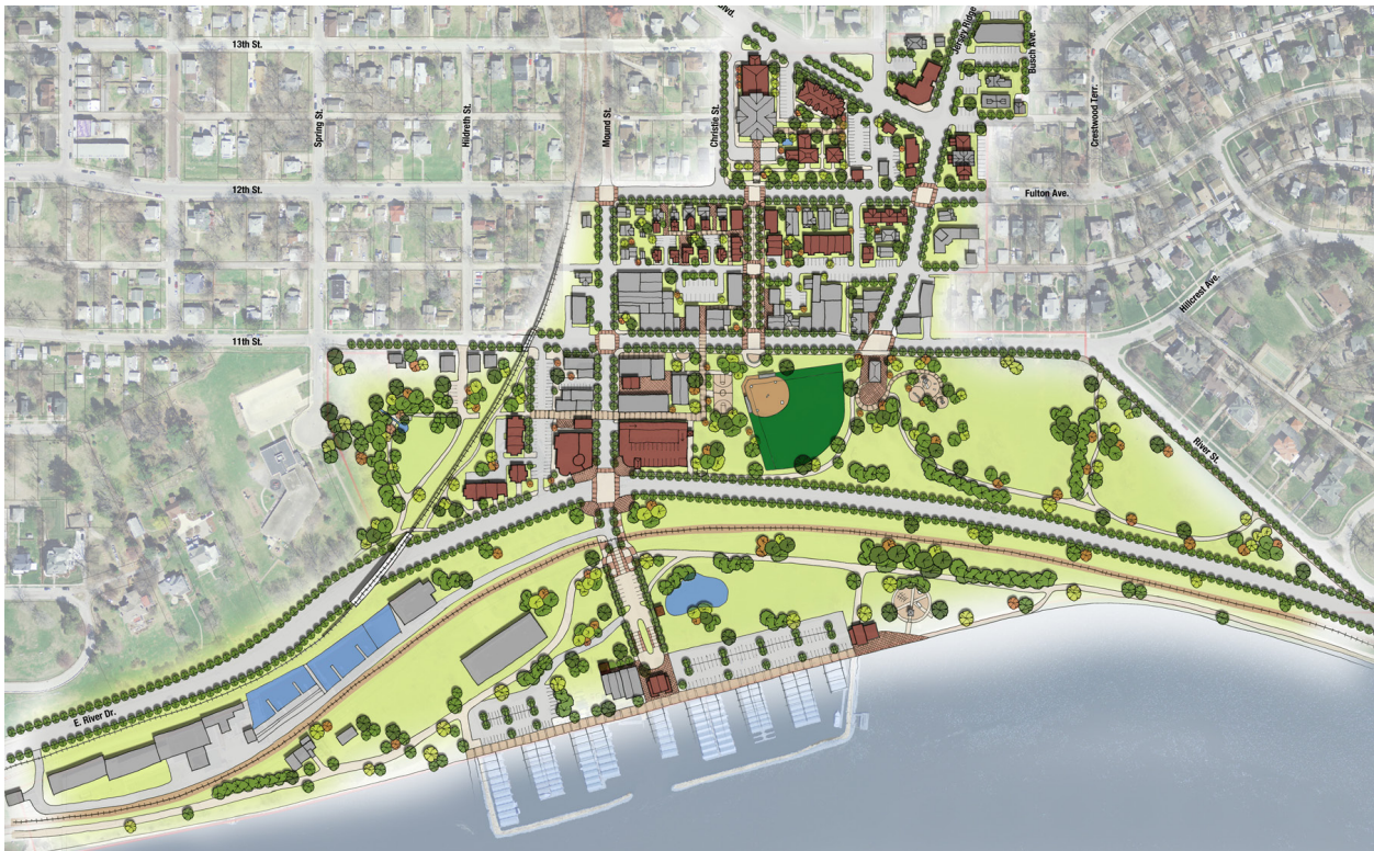
An overall illustrative map for the Village containing key gateways, open spaces, and opportunities for better connections between the riverfront and commercial core.