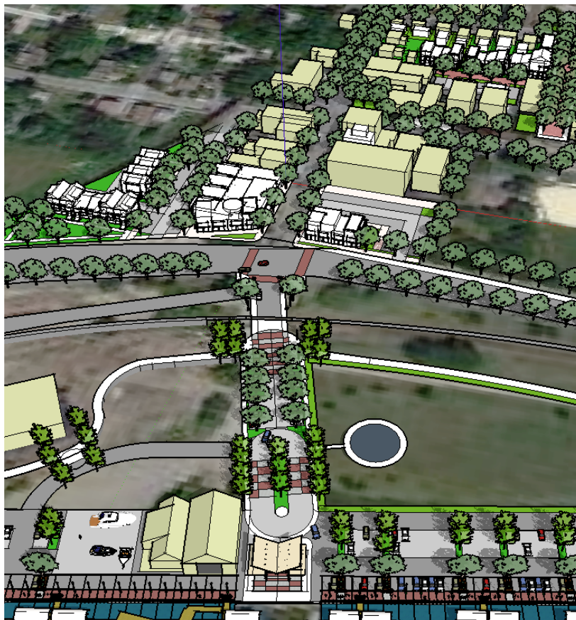
An overview of opportunity sites is illustrated above. Existing buildings are shown in green and new infill concepts in white.

Opportunities for improving properties exist throughout the Village of East Davenport. Winter & Company explored redevelopment opportunities on several sites throughout the Village that promote the community vision for the Village as a regional tourist destination and neighborhood center. The sites reflect one level of investment that may occur, which would be influenced by market conditions, ownership patterns and assistance programs that may become available over time.