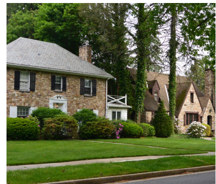
The Holmes-Foster/Highlands and College Heights Historic Districts represent a wide variety of architectural styles which contribute to the unique character of each district.