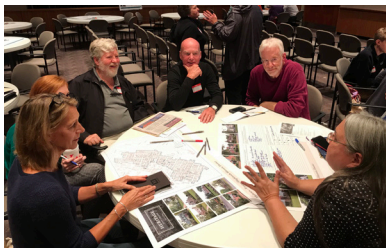
Community members identified key features and issues, as well as things they loved about the Holmes-Foster/Highlands and College Heights neighborhoods.