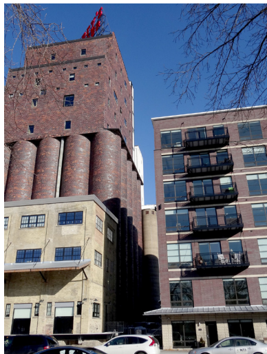
The new building to the right is an addition to the historic building (left) and follows the new design guidelines.