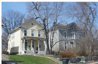
This represents one of the character areas found in the District.