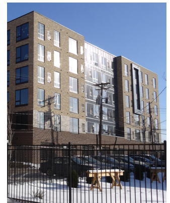
New infill project following the design guidelines.