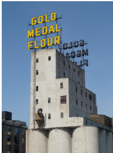
An historic resource found in the St. Anthony Falls Historic District.