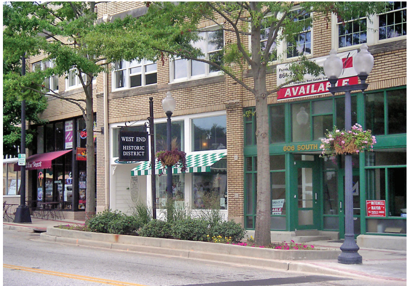
Investment in downtown Greenville has extended into the West End, which is designated as a historic district. A variety of restaurants, specialty shops and professional offices have located here. Building renovations comply with the new design guidelines.

The core of the downtown area is pedestrian-oriented, with buildings constructed to the sidewalk edge and storefronts that provide interest to passersby. Surrounding this zone is an area that is more auto-oriented, with freestanding office buildings and parking lots. The City sought to provide guidance for development in both of these areas that would acknowledge the differences in their character while strengthening the pedestrian environment and linking them together.