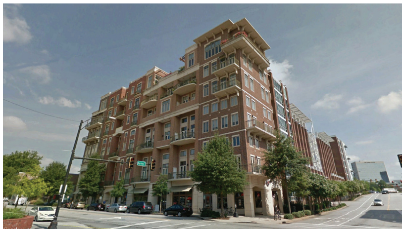
A before and after picture of a new mixed-use development includes retail at the street level, in compliance with the design guidelines.