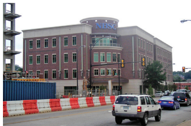
A new bank is located in the outer ring of downtown. The design provides interest to pedestrians and helps to define the street edge.