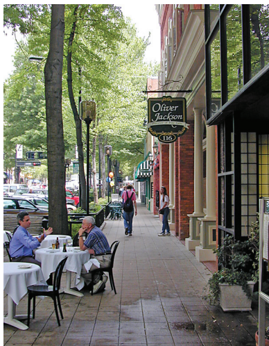
The core area of downtown Greenville is oriented to pedestrians. The guidelines promote street level activities that animate the street.

Greenville, South Carolina received the Great American Main Street Award for its revitalized downtown on May 19, 2003.