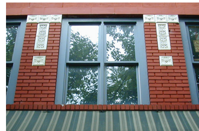
Guidelines for older, traditional buildings are provided.