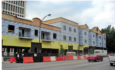
A new mixed use project complies with the design guidelines. The mass is divided into modules that reflect the traditional character of the area.