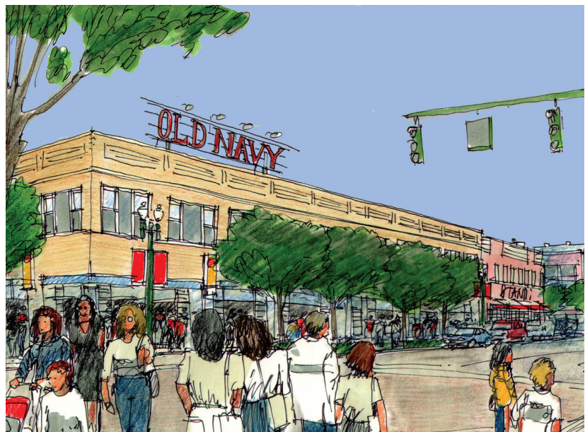
The downtown vision for the retail core included enhancements to the 12th Street Corridor. The rehabilitation of a historic resource is illustrated here.

In August 2003, the City of Canton adopted its new development plan and design guidelines. As an initial step, the Winter & Company team conducted a visioning start-up workshop with Canton representatives to identify plan components. This includes coordination of a variety of urban design systems, economic development strategies and housing development programs. A key feature of the project is the analysis of a variety of opportunity sites, including significant brownfield areas. It also includes a refocused retail area accented with a year-round and seasonal Community Market. The design guidelines address new infill and rehabilitation commercial building in Downtown Canton.