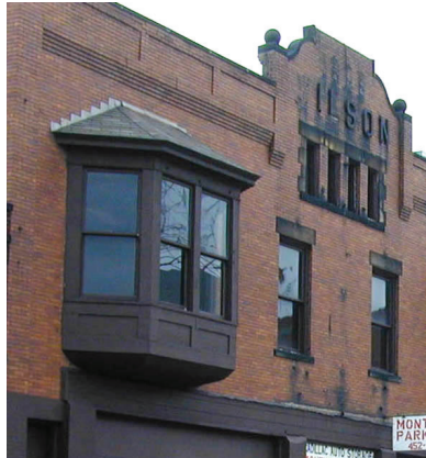
Before - Saxton Building