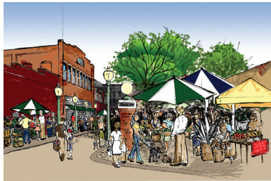
A seasonal community market is envisioned on an upscale alley in Downtown Canton.