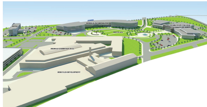
Diebold World Headquarters Campus - Model