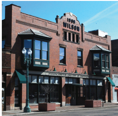
After - Community Market