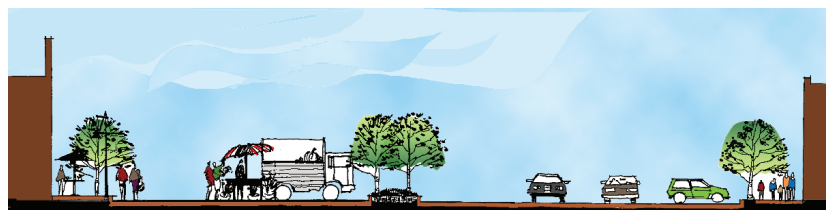
The cross-section shows the feasibility of using the existing parking and alley right-of-way area.