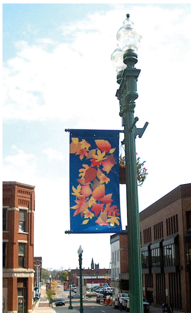
The plan extends the streetscape and palette of Downtown Canton.